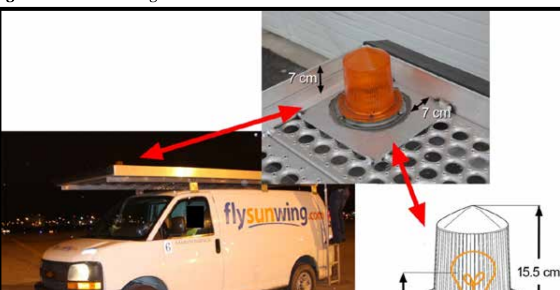
Figure 2. Grote beacon light installation on the maintenance van

The Greater Toronto Airports Authority (GTAA) has established and enforced rules regarding the operation of ground vehicles at the airport in its Airport Traffic Directives. These instruct operators parking a vehicle to shift the gear to park or neutral, apply the parking brake, and turn off the engine (in extremely cold conditions, the Directives allow, diesel engines in authorized areas may be kept running).<sup>7</sup>