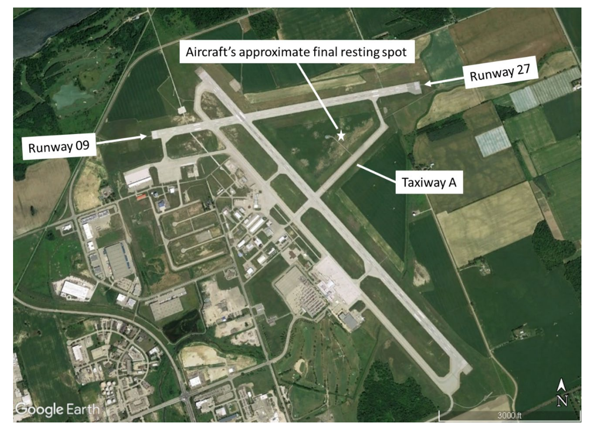
Figure 1. Satellite image of London Airport, Ontario, showing the runways and taxiway involved in this occurrence, as well as the aircraft's approximate final resting spot