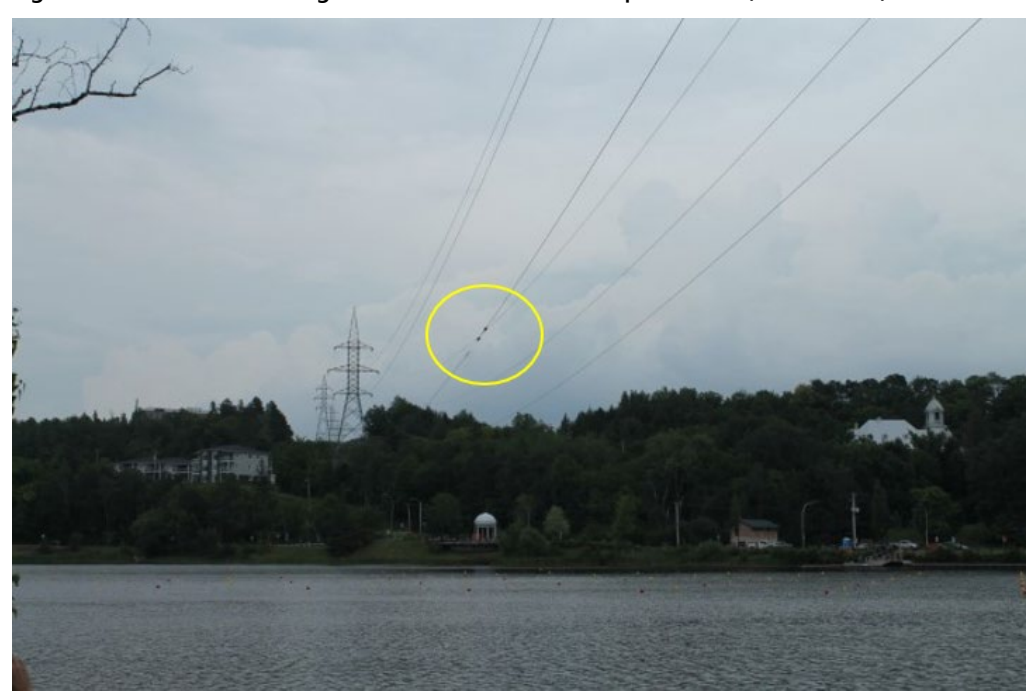
Figure 2. Photo of the damage to the lower cable of the power line (Source: TSB)

Figure 3. Photo of the damage to the left windshield post caused by the collision with the cable (Source: TSB)