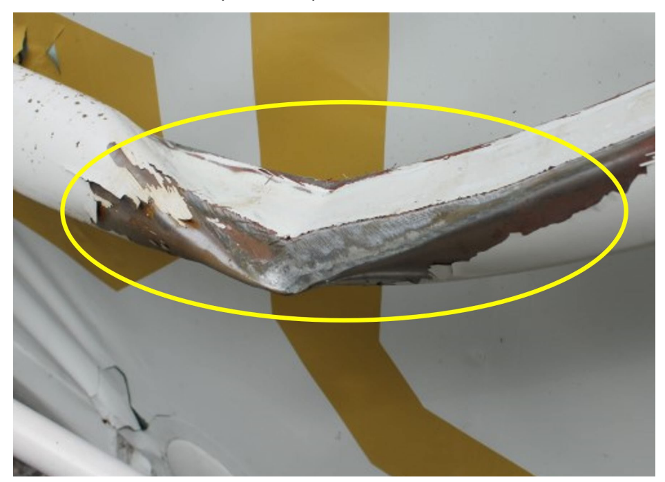
Figure 4. Photo of the damage to the left-wing strut caused by the collision with the cable