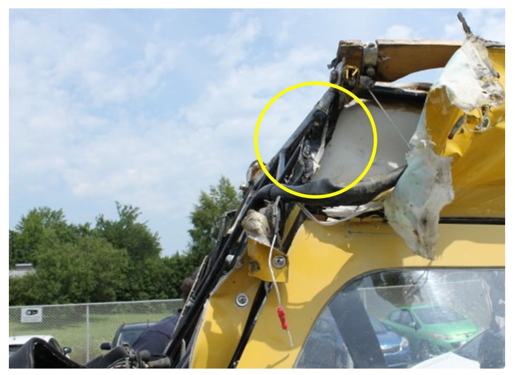
Figure 3. Photo of the damage to the left windshield post caused by the collision with the cable