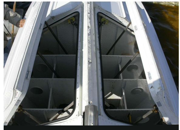
Figure 4 - Bomb doors open (float upside down)

During the approach, the Vital Action checklist was not completed as per the SOPs, and the bomb door armed switch was left in the On position. After completing the scooping operation, the pilot intended to retract the probes by pressing the probe switch but inadvertently pressed the adjacent bomb door switch. Since this system remained armed from the previous bombing run, the doors extended into the water. The drag from the doors and the water rushing into the floats through the door openings resulted in the aircraft nosing over. The proximity of the probe and bomb door push button switches and the missing cover plate on the bomb door switch increased the likelihood of selecting the bomb door switch instead of the probe switch.