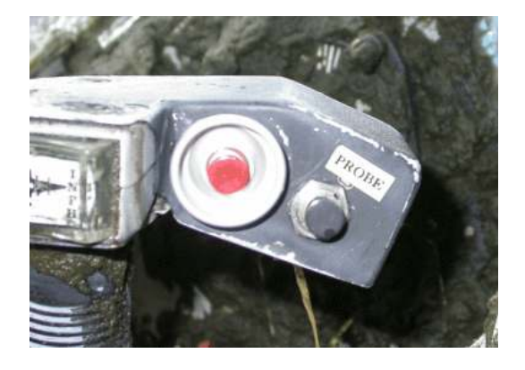
Figure 1 - Bomb door and probe switches on aircraft yoke

There is a probe control switch toggle switch located on the centre panel. At the request of flight crews, a push button probe switch was added to the control yoke. Once the modification was complete, the probes were controlled by the push button switch installed adjacent to the bomb door push button switch on the yoke (Figure 1). The pilots could now operate the doors and probes by moving the thumb between the two switches, while maintaining both hands on the yoke. The bomb door push button switch and probe switch are similar in size and type.