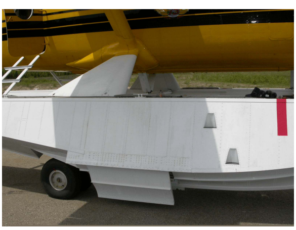
Figure 3 - Left bomb door open

The DHC-6 SOP section for Pre-Water Pick-up emphasizes the importance of completing the Vital Action checklist and Short-Final checks. There is a warning to pilots not to abbreviate the checklists in order to minimize the turn around time during the scooping operation. It further states that it is the pilot's responsibility to ensure that sufficient time and space are provided to complete all required checks.