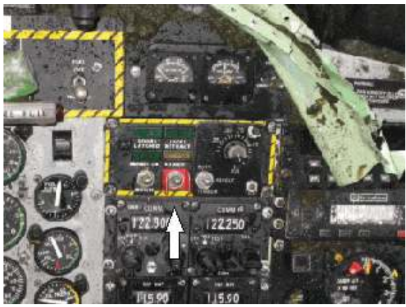
Figure 2 - System indicating lights and door armed switch (indicated by white arrow) in the On position

The DHC-6 Standard Operating Procedures (SOP), Pre-Water Pick-up procedures, state that the pilot will complete the Vital Action checklist and a short final gear and bomb door status check prior to each scooping operation. One of the Vital Action checks is to select the bomb door arming switch Off. The last check on the list is a short-final, visual gear check.