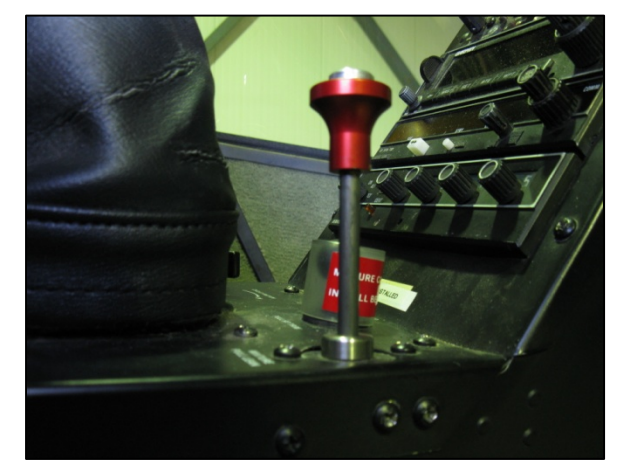
Photo 3. Mixture control pulled out to idle cut-off with guard removed

The engine and fuel controls were found as follows: