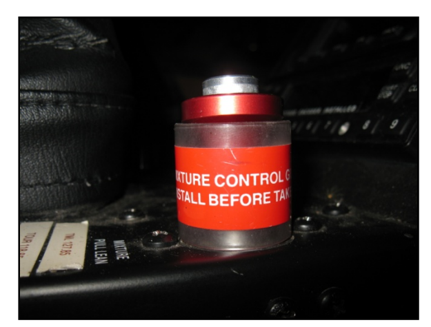
Photo 2. Mixture control pushed in to full rich with guard installed