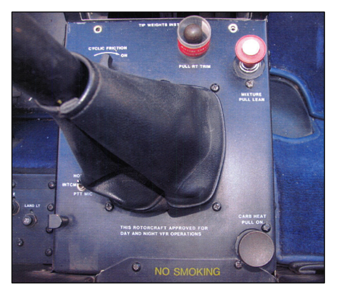
Photo 1. Centre pedestal with mixture control at upper right and carburetor heat control at lower right

The fuel mixture and carburetor heat controls are located on the centre pedestal in close proximity to each other. To aid in identification, the control knobs are shaped differently. Furthermore, the fuel mixture control knob is red while the carburetor heat control knob is black (see Photo 1). To prevent the inadvertent deployment in flight, the manufacturer's checklist directs the pilot to place a removable cylindrical plastic guard over the mixture control knob before starting the engine (see Photo 2). This guard is not to be removed until engine shutdown when the mixture control knob is pulled to the idle cut-off position (see Photo 3). This plastic guard is not permanently attached to the control panel. While the plastic guard was found at the crash site, it could not be determined whether it was used at the time of the occurrence.