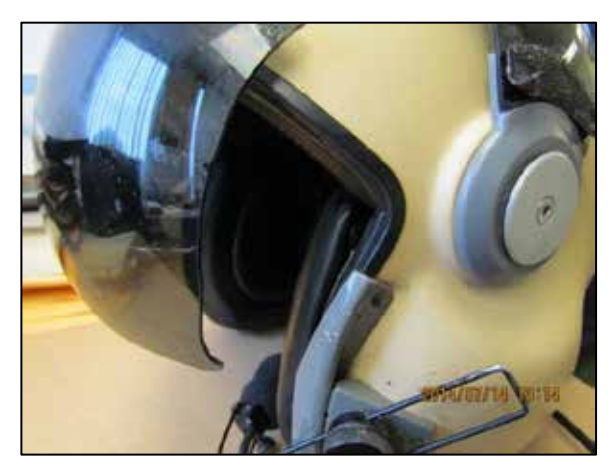
Photo 4. Pilot's helmet close-up view of the left side visor with impact damage (Source: Héli-Boréal)

Photo 3. Pilot's helmet impact damage to left side visor (Source: Héli-Boréal)