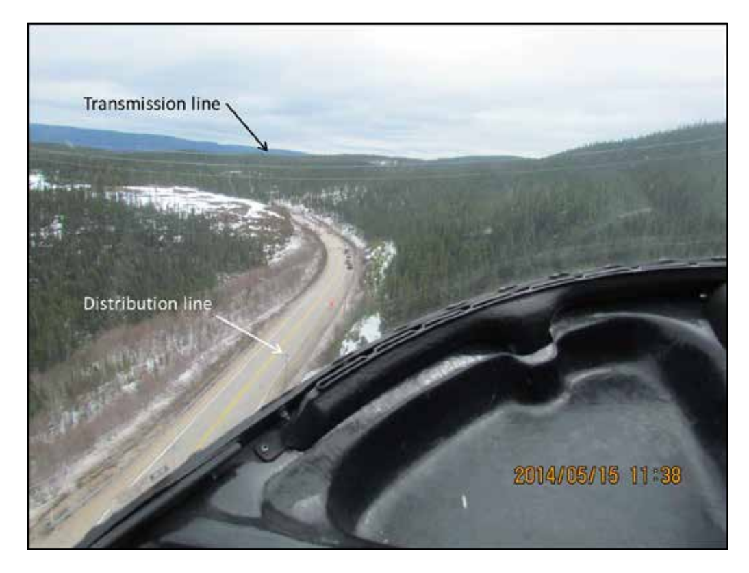
Figure 3. View from helicopter passenger seat approaching the transmission line

In addition, many factors can increase the difficulty of seeing wires in the low-level environment: