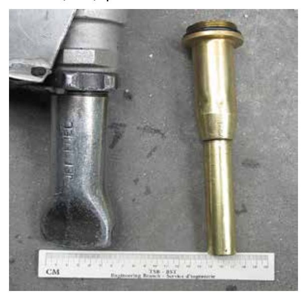
Photo 3. Exemplar flared spout (left) and reduceddiameter (brass) spout

occurrence flight. The pilots donned shoulder harnesses in addition to their lap belts. The pre-flight checks were completed; however, the fuel sumps were not sampled. The engines were started at 1813, and the crew obtained their instrument flight rules clearance, which would expire at 1819. Due to expected inbound traffic, the taxi to Runway 06 was expedited, and the take-off roll commenced at 1817 (Figure 1).