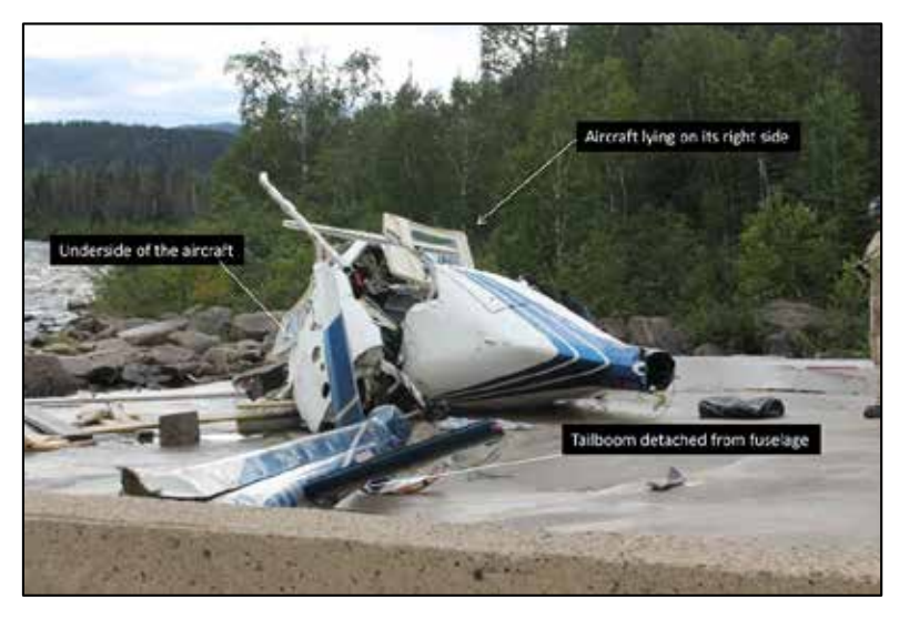
Figure 2. Aircraft wreckage

crashing, the TSB laboratory conducted a more thorough examination of the tail rotor system in November 2015, in the presence of representatives of Bell Helicopter and Rolls-Royce. No pre-existing damage was found. The investigators were able to determine that the antitorque pedal control tubes that govern the movement of the tail rotor blades severed sequentially upon impact. One of the control tube breaks was at the full left pedal position, confirming that the left anti-torque pedal was fully applied at the time of impact with the ground.