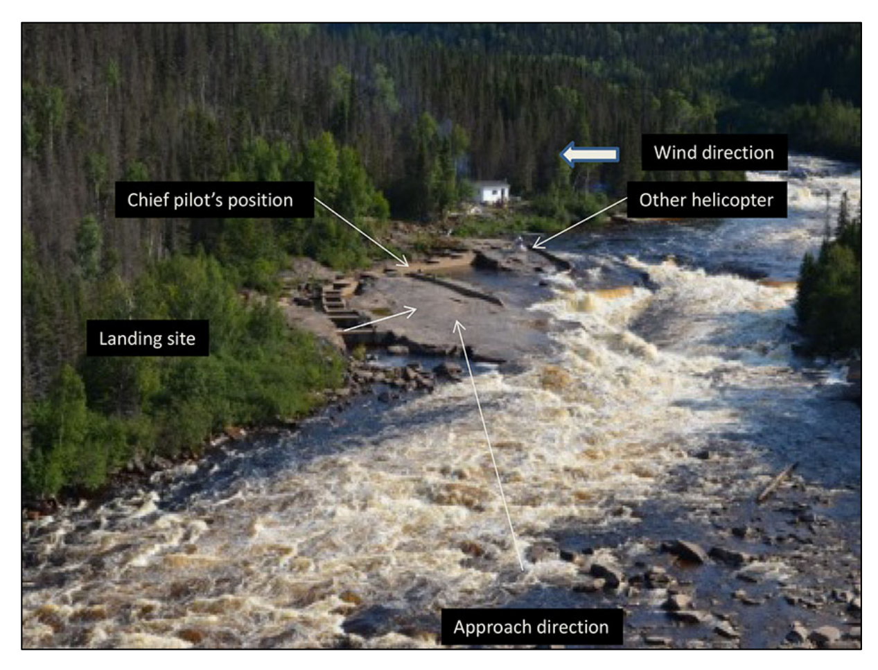
Figure 3. Landing site of C-GYBK