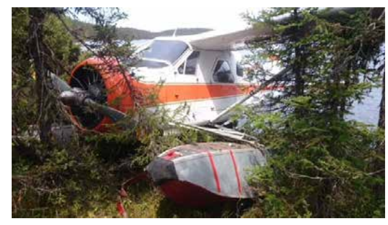
Figure 1. The aircraft after colliding with trees

The emergency locator transmitter (ELT) activated on impact, and the 1st signal was received by the Joint Rescue Coordination Centre (JRCC) in Halifax, Nova Scotia, at 1023.