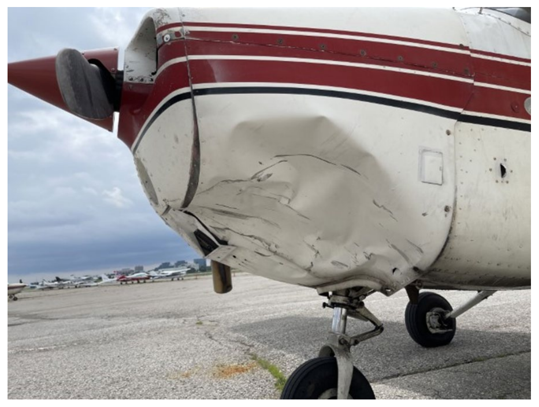
Figure 2. Photo of the damage to the occurrence airplane