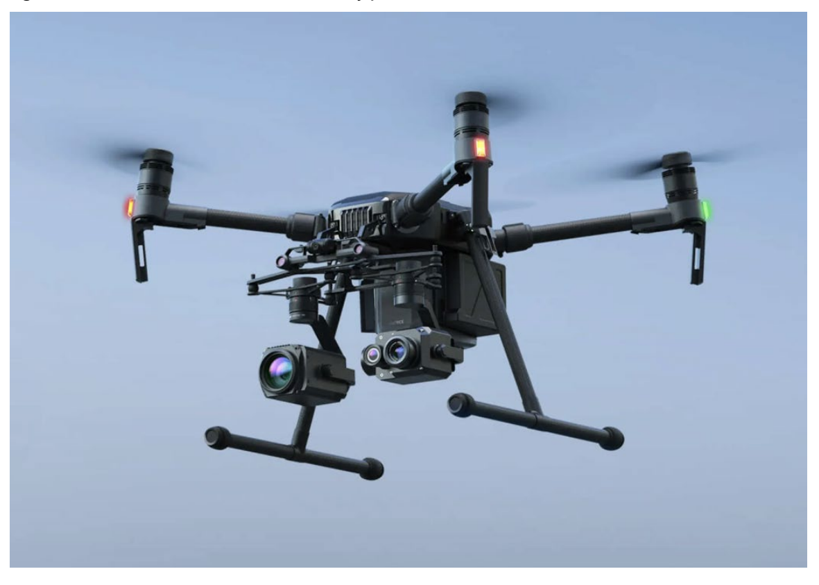
Figure 4. Photo of a DJI Matrice M210 remotely piloted aircraft

The DJI Matrice M210 is a quadcopter-type RPA with a maximum take-off weight of 6.14 kg (13.5 pounds) and dimensions of 34.9 by 34.6 by 14.9 inches (887 by 880 by 378 mm) (Figure 4). Depending on the intended mission, different payloads can be attached to it, such as infrared or high definition cameras. The RPA is controlled by using a remote control with an integrated viewfinder, or by plugging a smartphone into a controller and using the smartphone screen as the viewfinder.