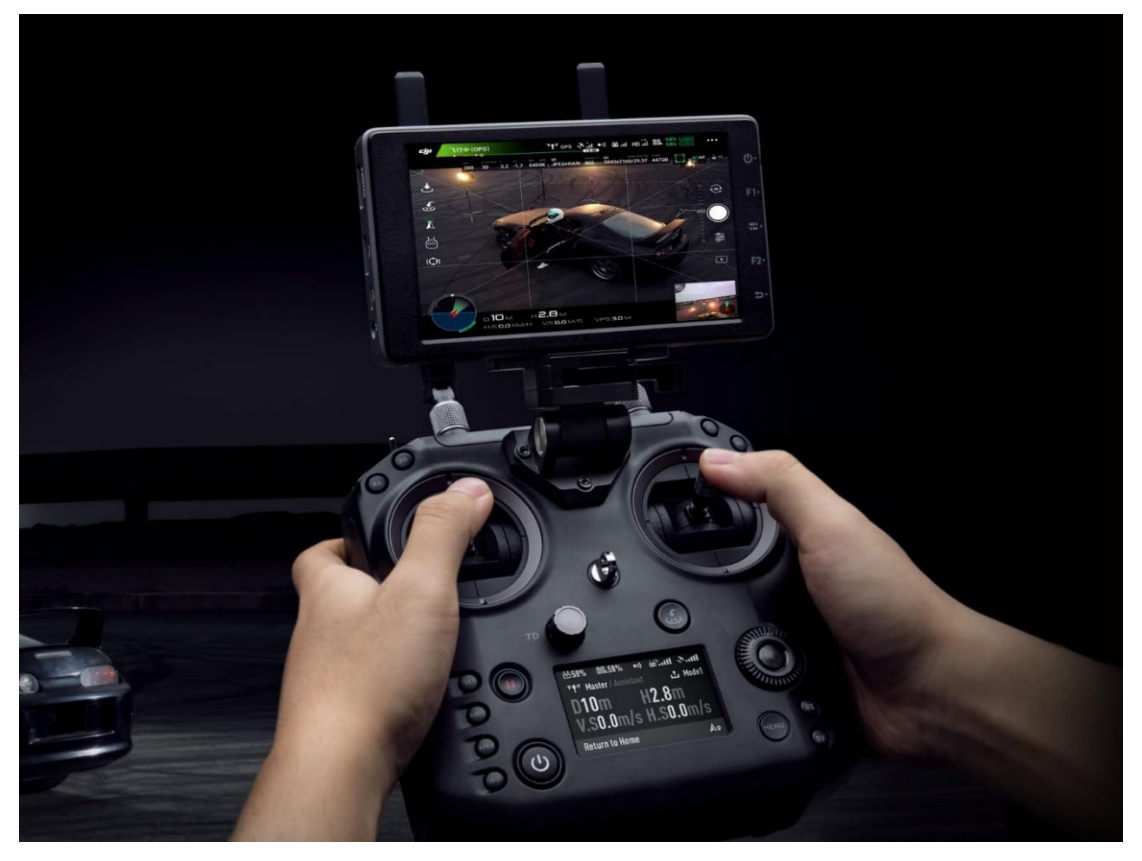
Figure 5. Photo of the DJI Cendence controller, with the CrystalSky monitor mounted on

The occurrence RPA was registered with Transport Canada (TC) as required by regulations.