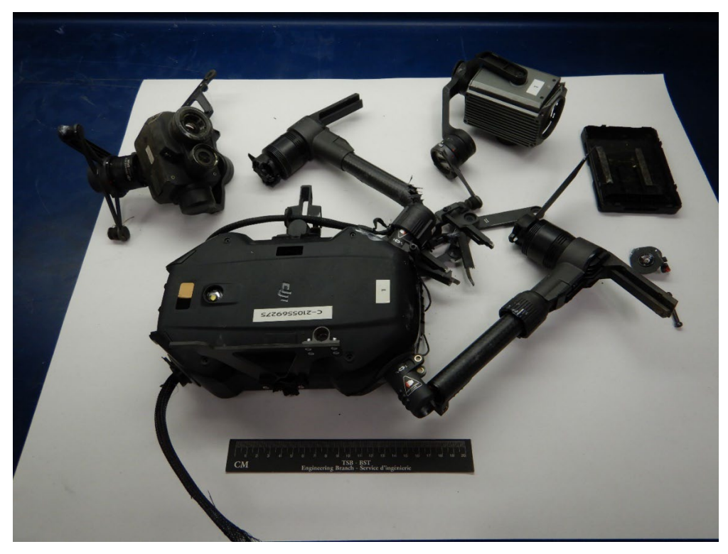
Figure 3. Photo of the occurrence remotely piloted aircraft parts that were recovered