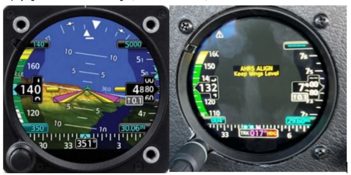
Figure 1. Garmin GI 275 multi-function instrument configured as an attitude direction indicator. Left image demonstrates a functioning attitude direction indicator. Right image shows the occurrence aircraft's attitude direction indicator displaying the "AHRS ALIGN" message.

At the same time, the aircraft's horizontal situation indicator (HSI)<sup>4</sup> also indicated a failure, displaying a red X over the HDG (heading) annunciation. The pilot attempted to switch the HSI to the ADI page using the instrument's touch screen function and selector knob, but was unsuccessful.