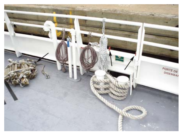
Photo 6. Port side Jacob's ladder secured to the main deck (left-hand arrow) and points for attachment when deployed (right-hand arrows)