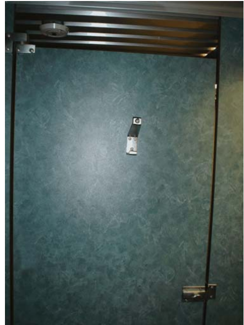
the inside of the washroom door

were located next to emergency exit doors or passageways Photo 3. Aft-facing steel coat hook on leading to emergency exit doors. For example, there were large metal garbage cans beside most of the emergency exit doors and at the entrance to each passageway leading