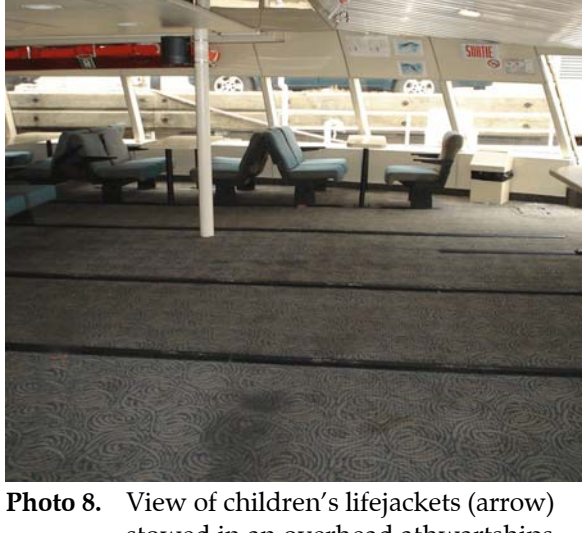
oto 8. View of children's lifejackets (arrow) stowed in an overhead athwartships rack and rows of seats removed from the deck