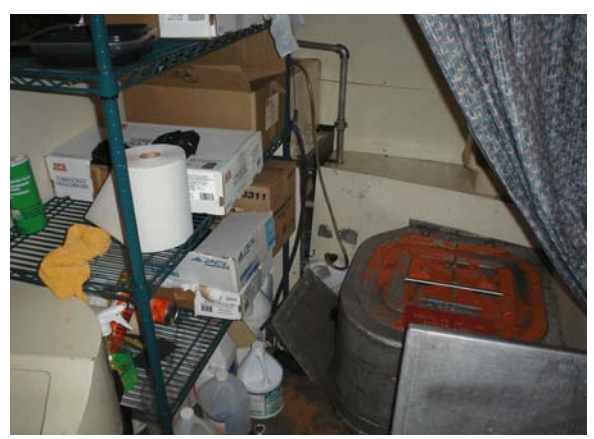
Photo 4. Unsecured stores near the starboard engine room escape hatch

unsecured stores stowed near the starboard engine room emergency escape hatch (see Photo 4);