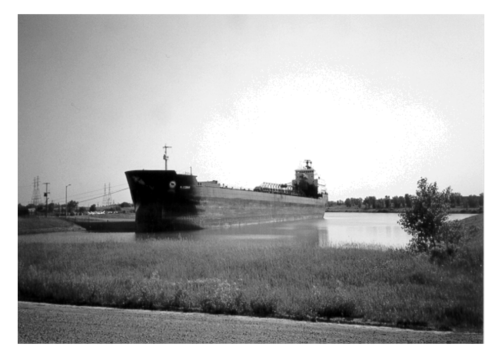
Appendix B - Photographs