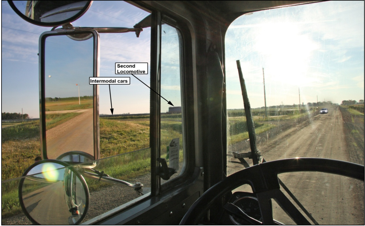
Photo 3. Simulated view approaching the crossing. The precise position of the vehicles and the environmental conditions may not be identical to those of the accident.