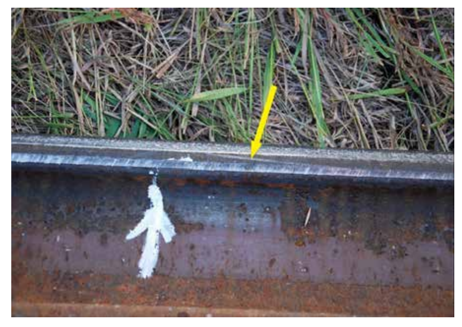
Figure 2. Wheel flange marks across the rail head at the point of derailment (indicated by the yellow arrow)

the inside rail to drop into the gauge. For lateral forces of 10 to 12 kips<sup>12</sup> to cause the gauge to spread, weakened securement of the rail (e.g., poor tie condition) was likely present.