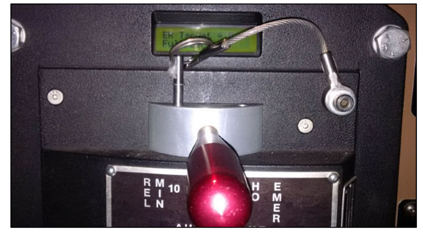
Figure 7. Automatic brake handle on newer locomotive with locking pin inserted into a hole on the left side of the base which prevents the automatic brakes from being released

Neither of the locomotives' RSCs were equipped with roll-away protection that activates when a predetermined speed is detected, nor were they required to be. Furthermore, the automatic brake handle on the lead locomotive did not contain a locking pin that could provide additional securement of the automatic brake handle, a feature that is found on many newer locomotives (Figure 7).