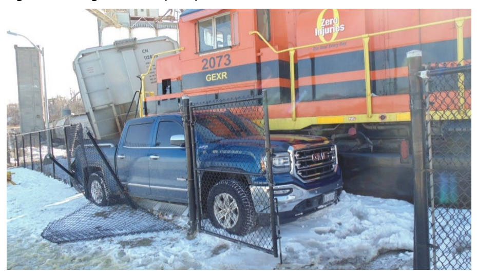
Figure 6. Damaged half-ton pickup truck

Emergency services were able to cut down the fence and free the occupants without further incident.