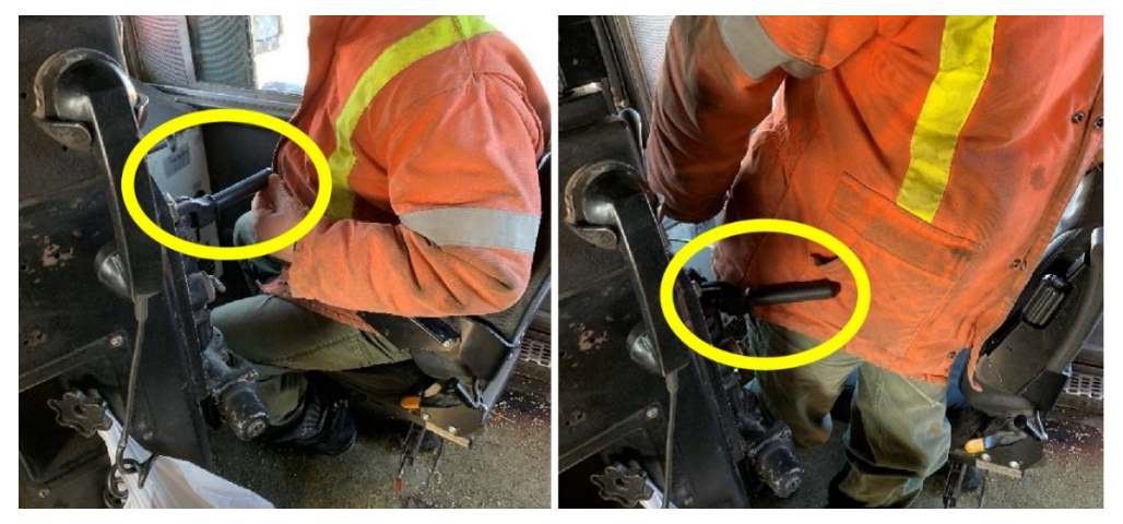
Figure 2. Photos from GEXR re-enactment of the locomotive engineer's movement in the cab. The left-hand photo shows the air brake applied, and the right-hand photo shows the air brake released.

At 1328:34 the train automatic brakes began to release.