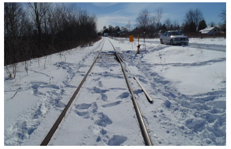
Figure 1. Split switch derail at Mile 46.19 looking eastward

Upon arrival at Goderich Yard, the conductor detrained to be in a position to handle the track switches when the train was shoved eastward back into the yard and doubled over onto 2 yard tracks. With the conductor on the ground, the train continued westward. The LE made a full service air brake application of the train automatic brakes and fully applied the locomotive independent air brakes.