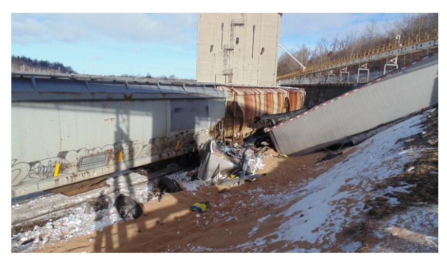
Figure 5. Damaged tractor-trailer and grain spilled on the ground

As the train rolled uncontrolled, it struck an unoccupied 18 wheel tractor-trailer loaded with 38 tons of grain that was parked on a crossing within the facility. Both the tractor and its trailer were destroyed and the grain was spilled on the ground (Figure 5).